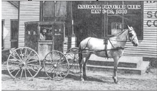
This horse and wagon delivered mail to area peach farmers.