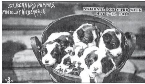
Niebergall liked to take pictures of animals and birds.