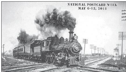
A Lake Erie & Western Railroad express.